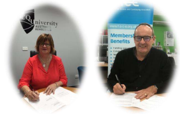
The FACE – NAEEA Memorandum of Understanding is signed, signalling ongoing collaboration between the two organisations.